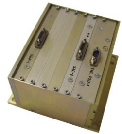
6 Slot Chassis

The ApolloDas 8600 Series is a new generation of flight qualified Modular PCM Encoders comprising a range of Signal Conditioning Modules, Control Modules and Power Supply modules.